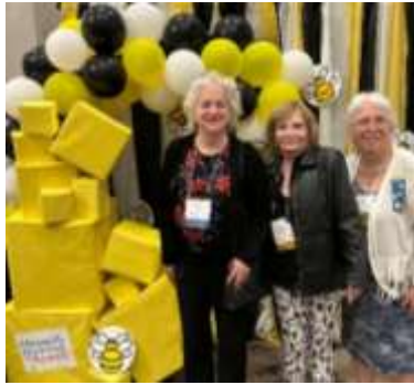
Our attendees having fun and popping up everywhere!