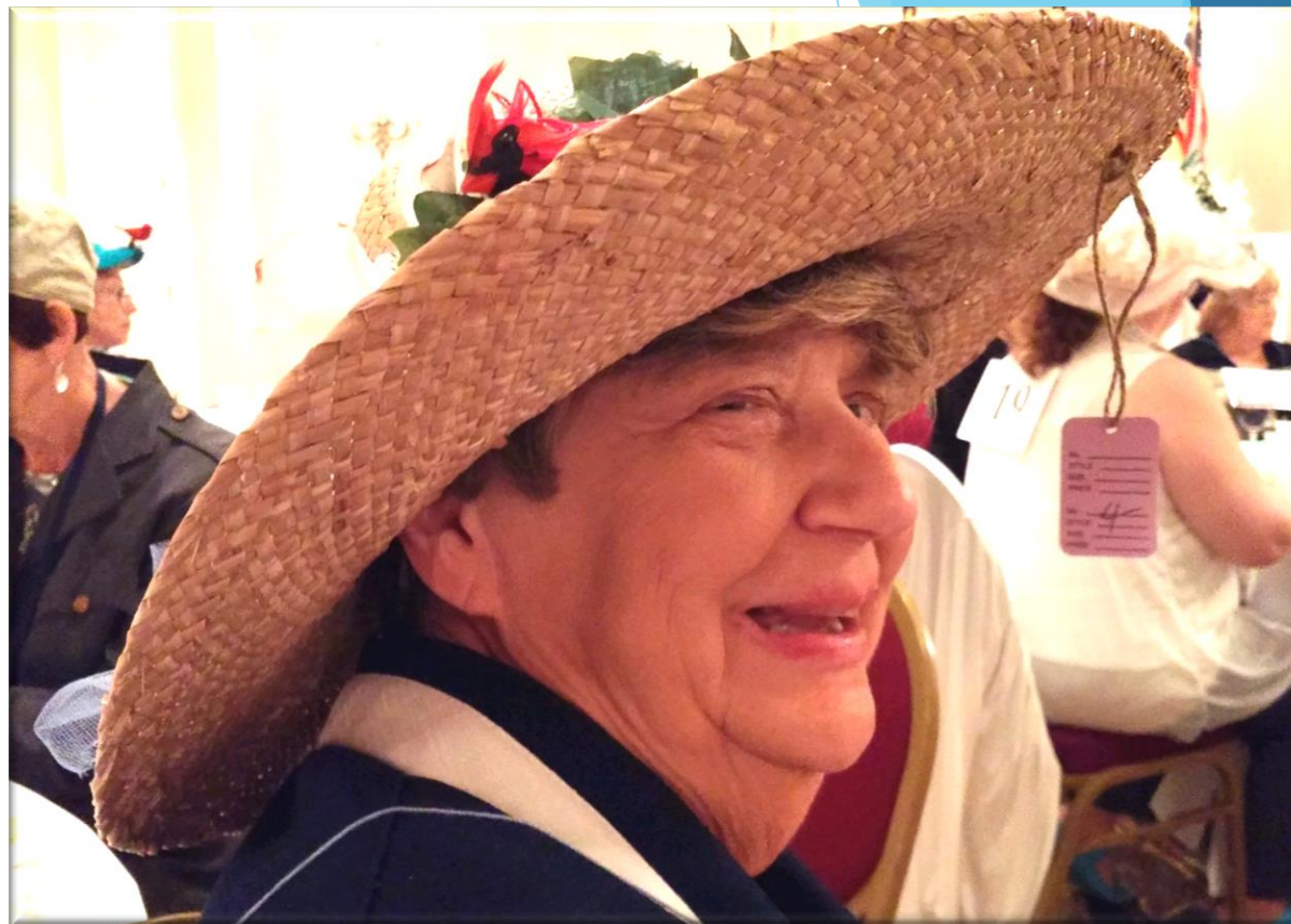
District Three Conference 2017