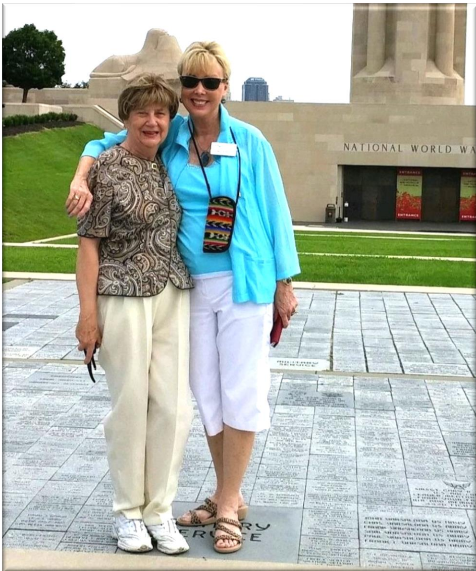
Kansas City Convention 2019