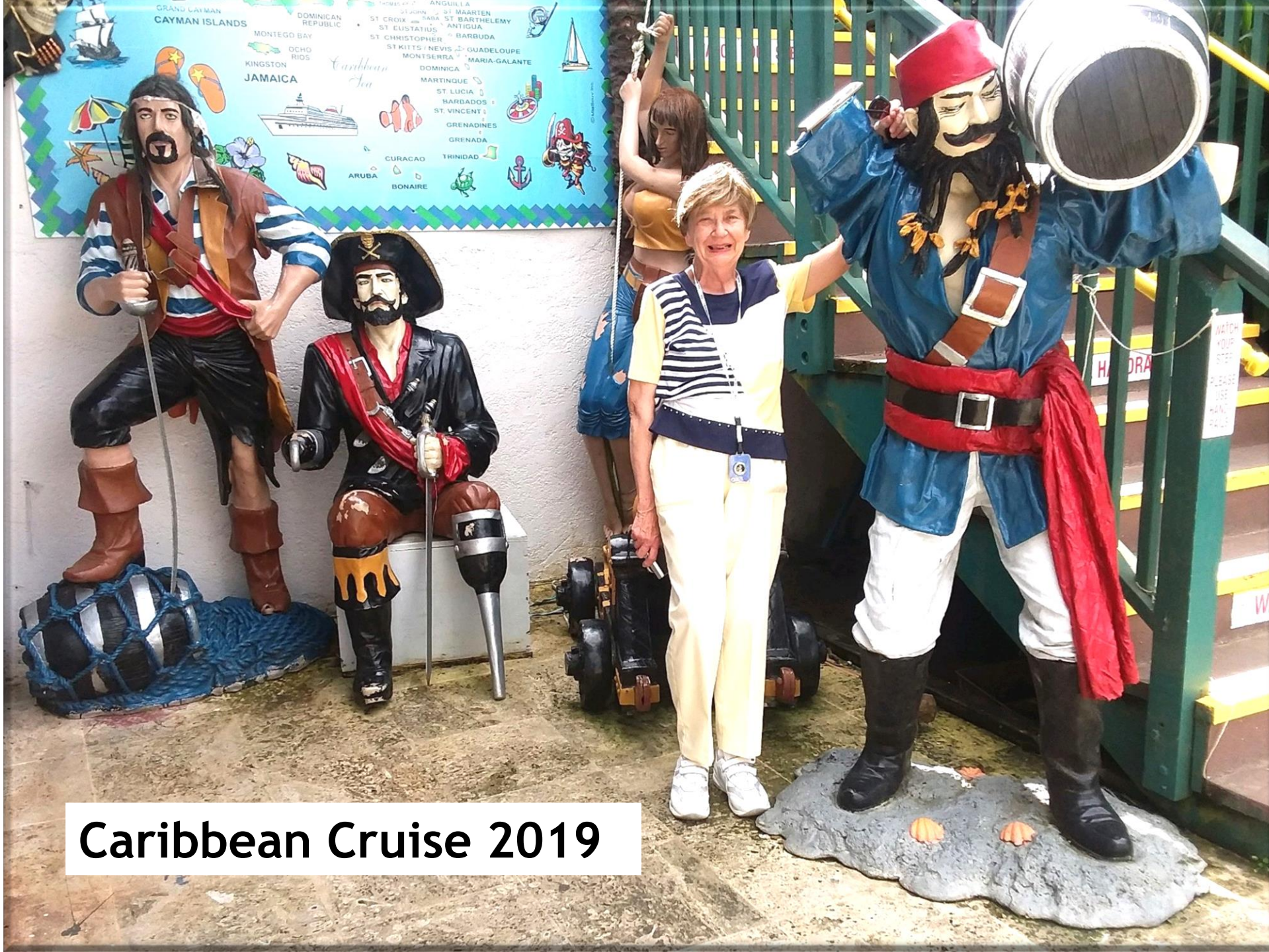
Caribbean Cruise 2019