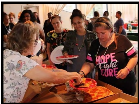
Serving lunch to the ladies from the STEPS program

Early December saw the club hosting a holiday luncheon for ladies who were a part of the Specialized Treatment, Education and Prevention Services (STEPS) program. STEPS is a private, not-for-profit organizations that offers comprehensive substance abuse education and treatment services to women, men and their children regardless of race, religion or national origin with priority given to pregnant injecting drug abusers, pregnant substance abusers and injecting drug abusers. The Orlando-Winter Park has been supporting STEPS with this holiday event for more than 30 years. The club provides an opportunity for close to 30 ladies to get away from their live in facility to enjoy a fun holiday luncheon, receive gift bags full of holiday goodies as well as basic self-care necessities. For the past three years, due to the generosity of local Dollar Tree Shoppers and with the support of Operation Homefront, we were able to offer the ladies the opportunities to "shop" for Christmas gifts for their children to have when they were allowed to come visit. The club members both serve the ladies their lunch as well as sit and "fellowship" with them throughout the event. They