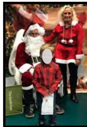
Santa, Mrs. Claus, Santa's Elf, and young guest