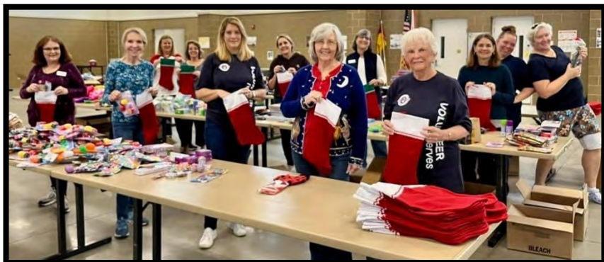
Members getting ready to stuff those stockings!

Throughout October and November, several club members travel to local Dollar Tree stores to gather donated toys, games and stuffed animals. On November 30 th , 2023, club members met at an Orlando Reserve Armory and in conjunction with Operation Homefront, stuffed more than 120 stockings for military families. The club also was able to donate left over toys to several other organizations to include the Center for Independent Living. The club provided 30 holiday bags of toys to CIL while sponsoring a craft at the CILs "Silent Night" event, we predominately deaf or hearing impaired families got to meet Santa Clause, make holiday crafts, enjoy Altrusa donated cookies and treat and receive the bags of toys provided courtesy of Altrusa and Operation Homefront.