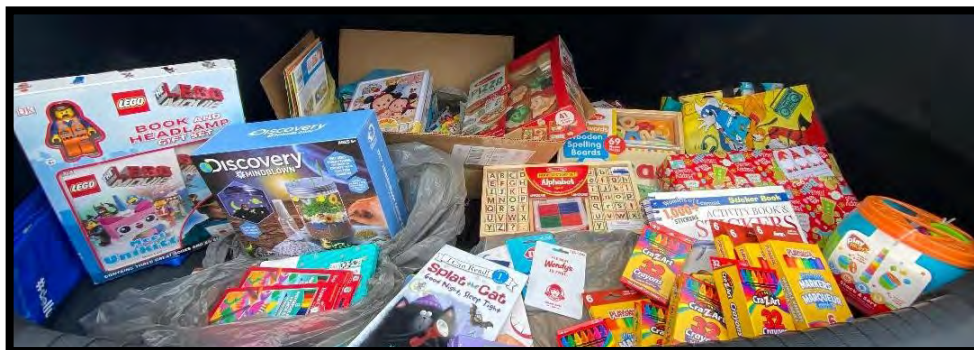
Items collected to support Bulloch County Schools