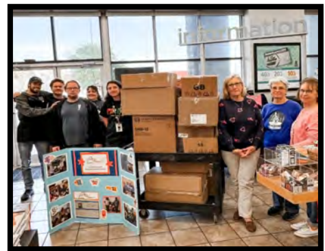
Donations from Partnership with Books-a-Million