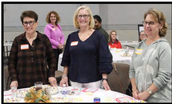
Members attending Book Bingo Event

Members also participated in hands-on projects, such as donating clothing and personal care items to Teal House, which supports victims of sexual assault, and donating school and educational supplies in support of the Bulloch County Schools Parent Engagement Team. The club is proud of their efforts to promote literacy in the community and looks forward to continuing their work in the future.