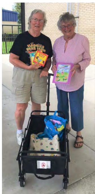
Altrusans with “Tiny Tot Bookmobile”

During the event, the families enjoy a meal together – no cooking for Mom or Dad tonight! After dinner there is story time for the children and an informative program for the parents. The final part of the evening has the families working on projects together – making friendship bracelets or apple prints!