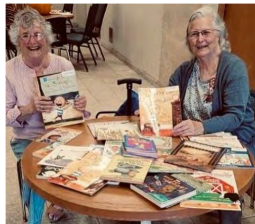
Book Distribution at Monday Funday

Where does Altrusa fit into these Fundays? We think we have the best part – we give away books to all the children in the family, not just the Head Start children. Through donations from members of the community and organizations such as Lisa Libraries and Hindi's Libraries, we are able to maintain a decent supply of books – no mean feat because there have been up to 80 people attending one Funday! The parents and children love books and look forward to seeing what we have to offer each evening.