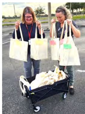
Head Start Staff Receiving Book Bags for Family Literacy

As part of the Head Start Program, families set goals for the year. Several families have set improved literacy as their goal. To meet this goal, Altrusa prepared 20 book bags filled with over 80 books for all the children in the families. Head Start Staff will be adding guides about reading with children and logs for the family to use to keep track of their reading together; and, then distributing the bags to the families. St Augustine Altrusans are more than encouraged to help these families in achieving their goal of increased literacy.