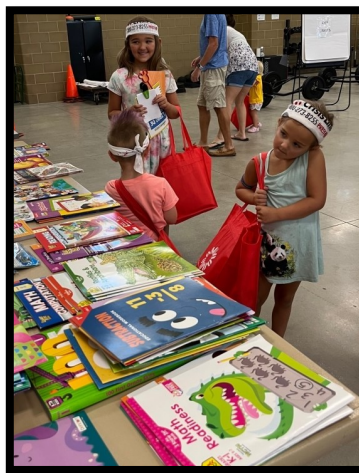
Back to school kids pick from a selection of school activity books provided by donations from Altrusa Orlando-Winter Park members.

The Altrusans were also able to distribute many of the remaining school supplies to Orange and Seminole county organizations that provide them to teachers to help supplement supplies in the classroom for the 2023-2024 school year.