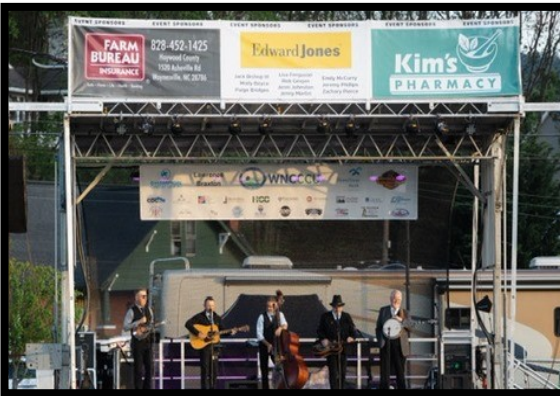
Balsam Range, a “local” bluegrass group, known internationally for their grammy-winning songs