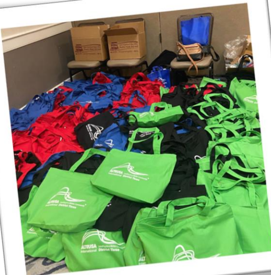
We created 150 Family Care Packs In zippered tote bags