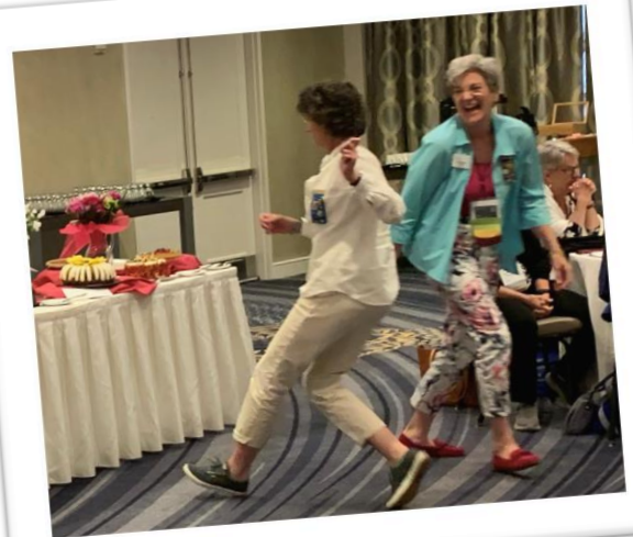
Foundation Dessert Dash Fundraiser was sooooo much FUN!