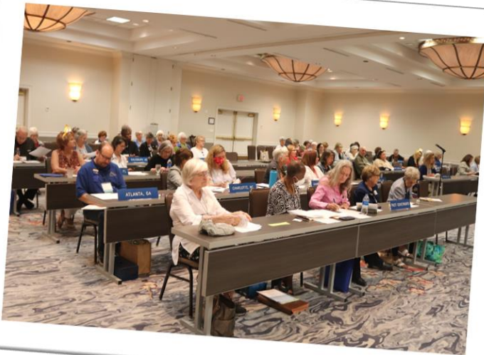
First Business Session